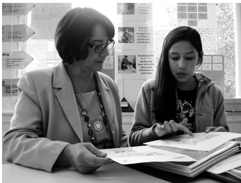
Student discusses exhibition portfolio with mentor

In the final year of the PYP the students participate in a culminating project, the PYP exhibition. This requires that each student demonstrates engagement with the five essential elements of the programme—knowledge, skills, concepts, attitudes, action. It is both a transdisciplinary inquiry conducted in the spirit of personal and shared responsibility, as well as a summative assessment activity that is a celebration and rite of passage, symbolic and actual, from the PYP into the middle years of schooling (example 16).